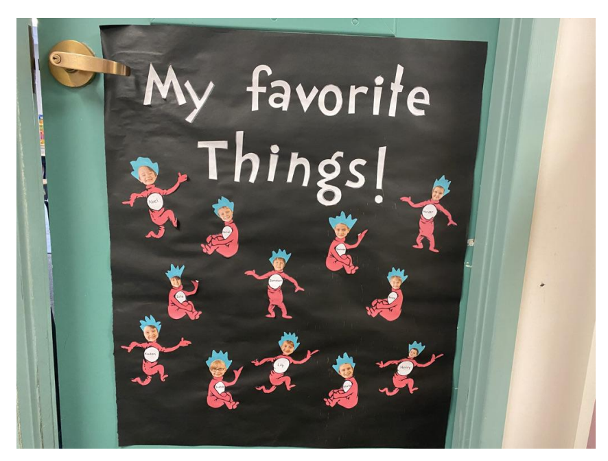
Favorite things hang out on the Kindergarten door.