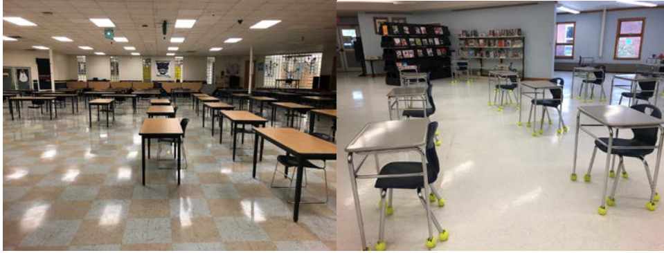
Lunch areas: cafeteria and library.